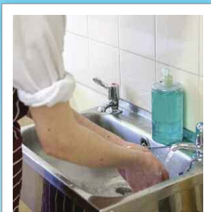
Wash your hands!