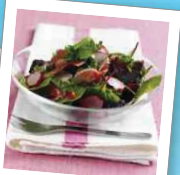
Consider table settings