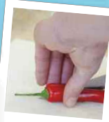
Cut, using the bridge hold