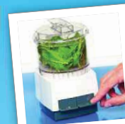
Mix, using a piece of equipment safely

Prepare ingredients using a range of different food skills. You can adapt a preparation method to create your own recipe.