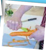
Peel, using a vegetable peeler