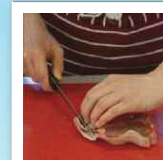
Trim, using the claw grip