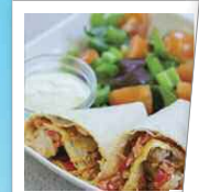
Use contrasting colours and garnishes