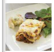
Serve an appropriate portion size