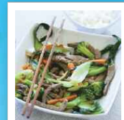
Use interesting serving dishes

Serve the dish in a visually appealing way, with side dishes which reflect healthy eating recommendations.