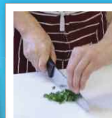
Chop, holding the knife safely