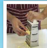
Grate, being careful not to grate knuckles