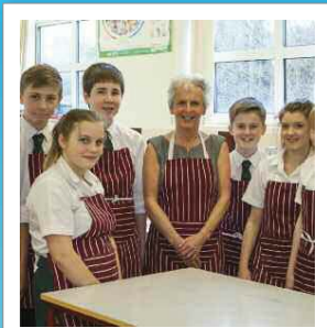
Tie back long hair, wear an apron, remove jewellery and roll up sleeves.

Before cooking, prepare yourself and your work area, so you can start work in a safe and hygienic way.